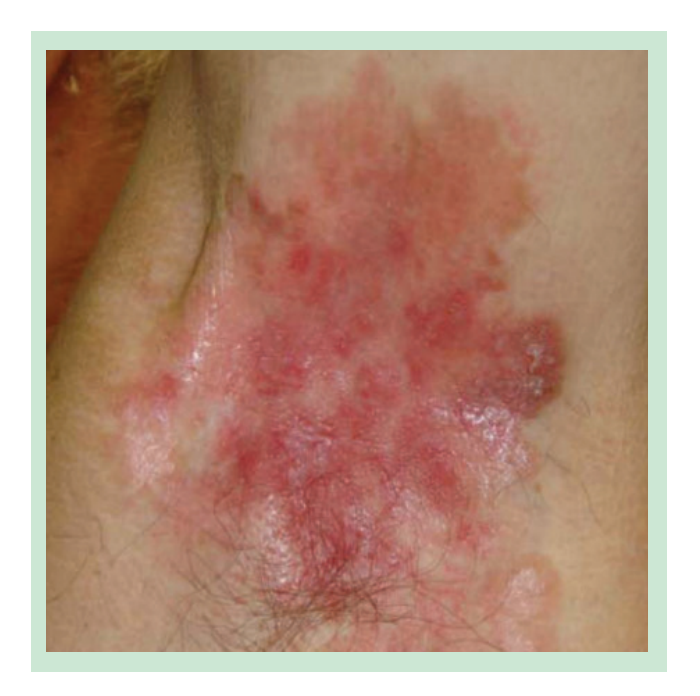
Figure 1: Erythematous spread of Paget's disease near the armpit.

Padmanabhan underwent regular checkups for the next three years from June 2010 to March 2013. In 2013, the tumor showed signs of growth, confirmed by examining a biopsy of tumor tissue, microscopically.